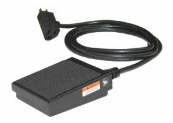
(cable with 3-pronged series connector shown)